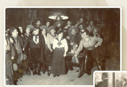
At the gala dinner after the premiere of La fanciulla del West

It was the last appearance of Puccini in Hungary, the plans to invite him for the Hungarian premiere of Il trittico in 1922 were never realised.